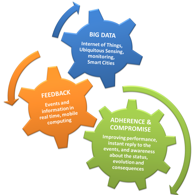
Fig. 2. The awareness loop.

The motivation of the people is the major outcome that can be reached from the Internet, in order to break all the frontiers of the smart cities and social networks. Thereby, reaching an Internet of People (IoP) [24], where all the potential of the Internet of Things, Smart Cities and Big Data is focused on improving our quality of life, and provide us the tools for