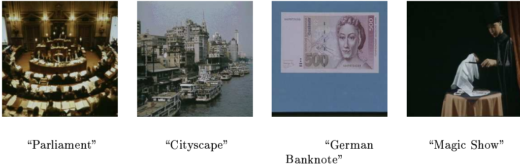
Figure 1: Sample images from the Viper test database.

Negative feedback was not employed in this experiment. This set of relevant images was then submitted as a second query.