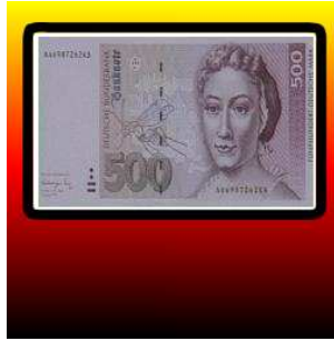
Figure 1. Example of an MRML extension. The user has requested a banknote (marked white) with a background different from the one presented (marked black).

<cui-prolog-query result-container="ResultList" cui-relative-weight="0.1"> <![CDATA[ findall(Image,contains(banknote,Image),ResultList). ]]> </cui-prolog-query/> <user-relevance-list cui-relative-weight="0.9"> <user-relevance-element image-location="http://viper.unige.ch/banknote.jpg" user-relevance="1"/> </user-relevance-list> </query-step> </mrml>