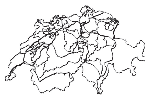
Fig. 1. Swiss national roads with limits of the cantons, as displayed in our simulation platform

Therefore we want to investigate whether speeding restrictions can increase the efficiency of highways, and to determine automatic speeding restrictions that optimize highway utilization. As a methodology we decided to develop an agent-based micro-simulation to investigate the above hypothesis and to determine optimal speeding policies. A distributed speed regulation needs to split highways into segments with constant length so that on each segment one speed limitation can be imposed. Constraints between the speed limit on neighboring segments have to ensure that the vehicles do not have to break too abruptly.