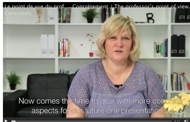
Figure 2 : Extract of the cours about oral communication

production of distance didactic scenarii. Thus, the Center designs courses, working on both narration and production.