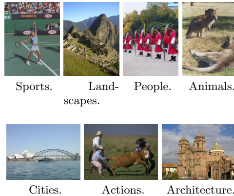
Fig. 1. Sample images from the collection.

facilities and ongoing social projects. The collection contains many different images of similar visual content, but varying illumination, viewing angle and background. This makes it a challenge for the successful application of visual analysis techniques.